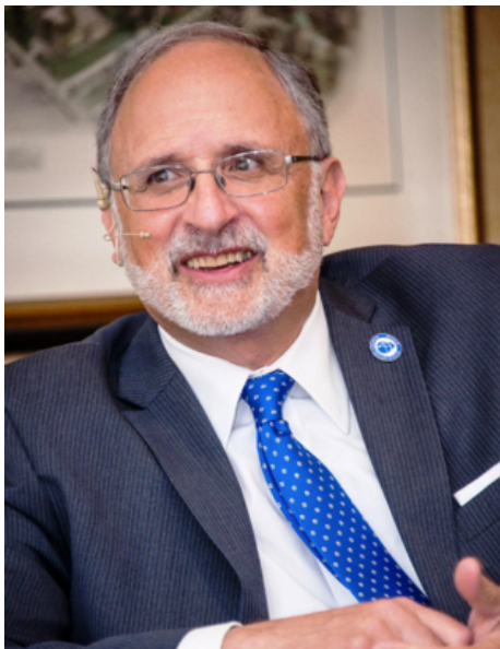
President, The World Affairs Council of Atlanta